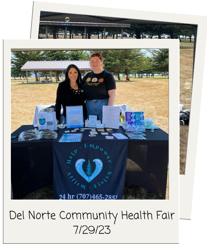
Del Norte Community Health Fair 7/29/23