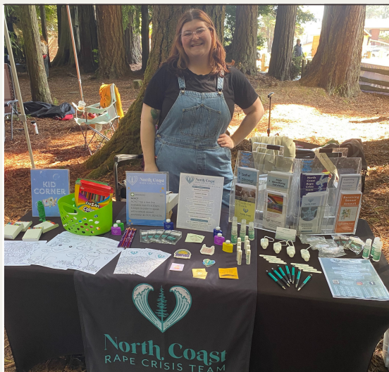
Recovery Happens Picnic 9/9/23