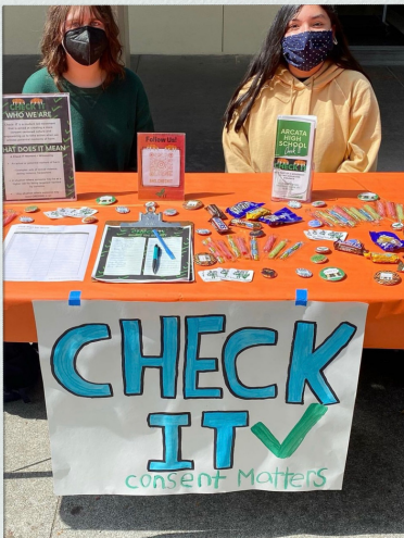
Check It members table at a club event