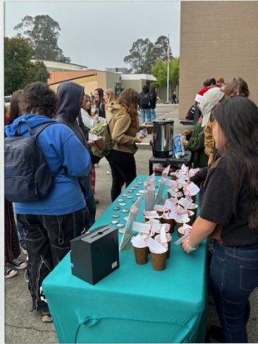
Arcata High Check It members hand out hot chocolate and positive affirmations