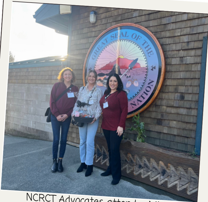
NCRCT Advocates attend a MMIP Educational Awareness Event presented by Tolowa Dee-ni Nation 11/15/23

Cal Poly Humboldt Campus Advocate Team Drop In Hours: