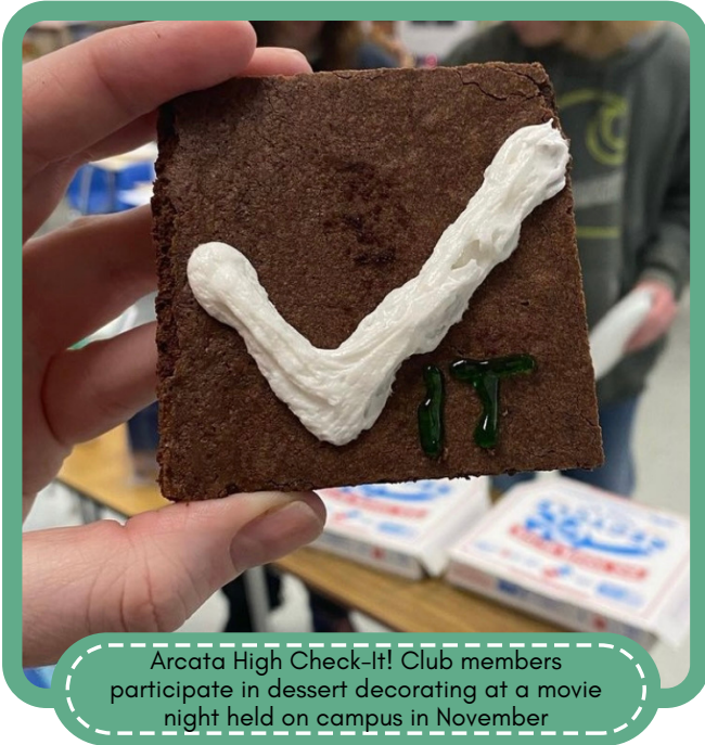
Arcata High Check-It! Club members participate in dessert decorating at a movie night held on campus in November

Over the last few years, our Education team has expanded our youth-led bystander intervention clubs at local high schools. We began in 2018 at our pilot school, Arcata High, and last year expanded to Hoopa Valley High School and the Del Norte Youth Opportunity Center (formerly juvenile hall). Each of our clubs meet weekly to discuss topics related to affirmative consent, bystander intervention, rape culture, human trafficking, and activism in our communities. Being a youth-led initiative has given students a voice in deciding what topics and activities they feel will reach the student populations at large. Club members create and organize events like poster campaigns for awareness months, movie nights discussing rape culture in media, and