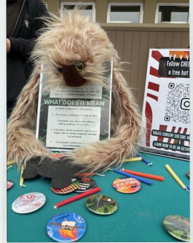
Check It table featuring information on consent and custom made buttons