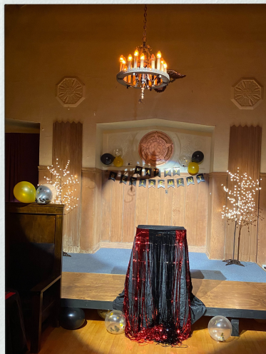
NCRCT was honored to receive the profits from American Legion 274's Murder Mystery event in November 2023